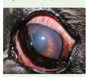
Glaucoma (high pressure) in this eye has caused redness of the white of the eye and a blueish clouding of the cornea