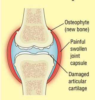
Arthritic synovial joint with damaged articular cartilage

So what can be done? Although arthritis cannot usually be cured, even those pets that are only mildly affected can benefit from treatment, and the most effective approach involves several factors. Weight loss can make a massive difference for pets carrying a few extra pounds and in conjunction with this, regular exercise (including swimming or hydrotherapy) is also helpful. Many pets also benefit from anti-inflammatory pain relief medication and food supplements containing glucosamine and chondroitin sulphate.